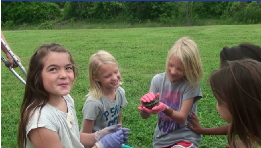
Figure 6 Final Scene From Sophia Finds a Turtle