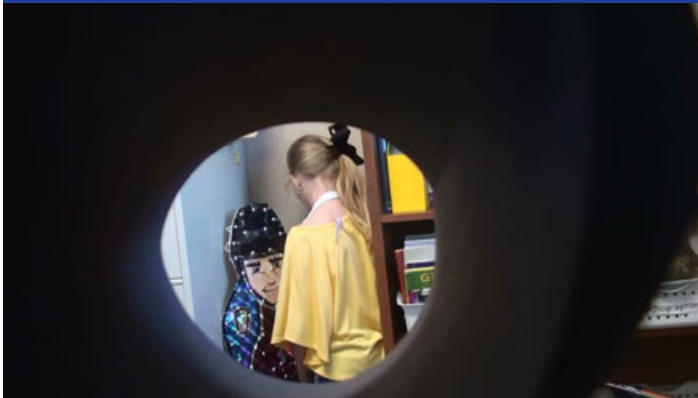
Figure 4 The Ghost in the Hotel Room